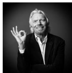
Branson House (Richard Branson)