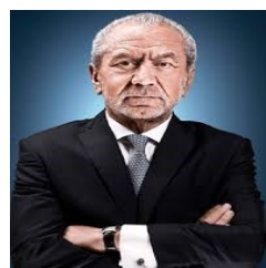
Lord Sugar House (Lord Alan Sugar)