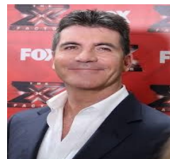
Cowell House (Simon Cowell)